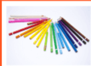
Quiz: Psychology 101 Part 2